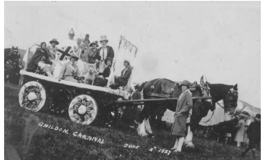
Shildon Carnival, 2nd June 1927.